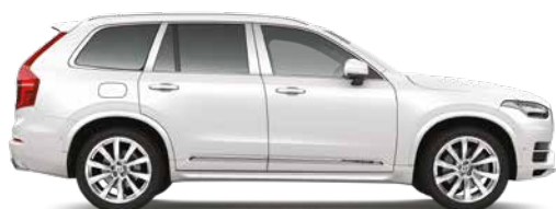
707 Crystal White, Metallic