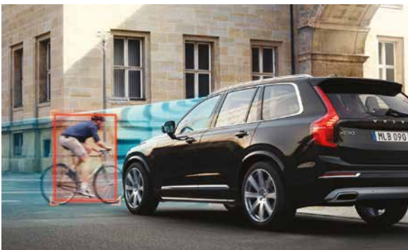
Pedestrian and Cyclist Detection with Full Auto Brake