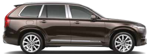
722 Maple Brown, Metallic