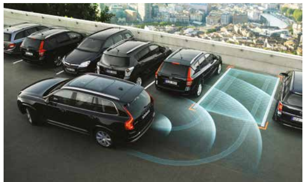
Park Assist with Park Assist Pilot (automatic parallel and perpendicular parking)