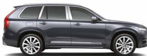
723 Denim Blue, Metallic