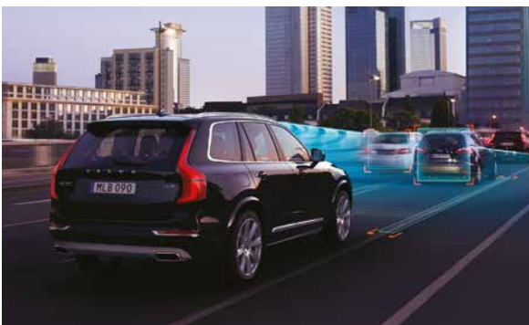
Adaptive Cruise Control (ACC) with Pilot Assist and Distance Alert