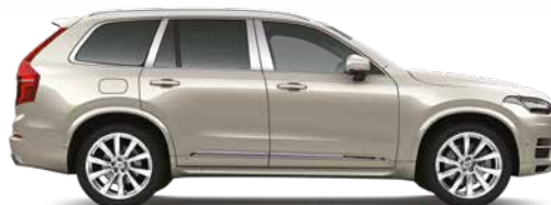
719 Luminous Sand, Metallic