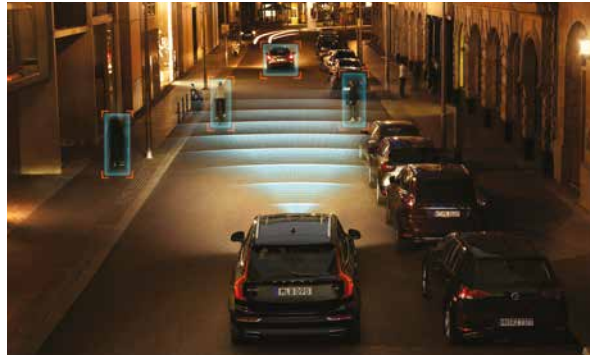
City Safety in darkness