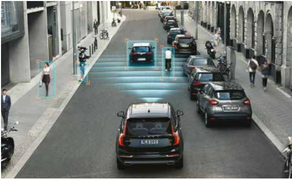
City Safety with Front Collision Warning and Full Auto Brake