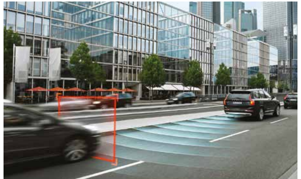
Rear Collision Mitigation