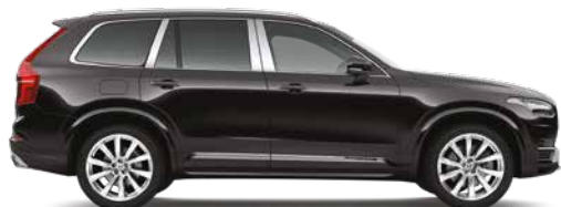
717 Onyx Black, Metallic