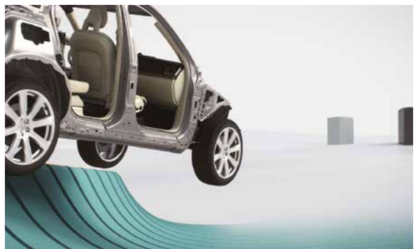
Run-off Road Protection

Note: Above images used are only for illustration purpose.